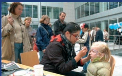
Mainly children could realize themselves in the atrium