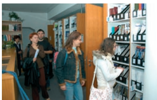
The tour of the building continued in the library