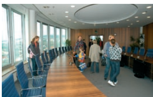
The meeting rooms of the Bank Board in the 30 th floor

The NBS has made accessible the meeting room of the Bank Board of the NBS, the office and conference room of the governor and the library. During the whole day, the visitors could discuss with experts assessing the authenticity of banknotes and their counterfeits and to view the exposition of the NBS Archives and of the Museum of Coins and Medals at Kremnica. In the atrium of the building, the visitors could see the historical manual coinage of