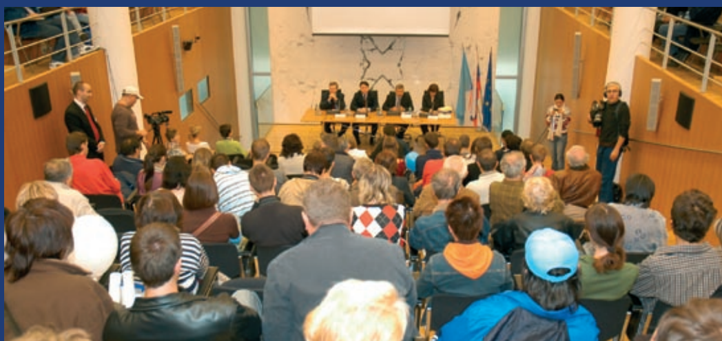
The informal meeting with the governor and vice-governors of the NBS met with great interest of the visitors