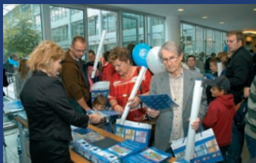
The visitors showed large interest in information materials