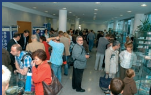
The exposition of the Department of banknotes and coins of the NBS and of the NBS Archives