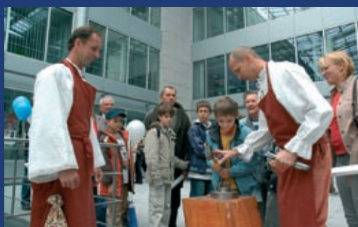
Manual coinage of a counter in the presence of professionals