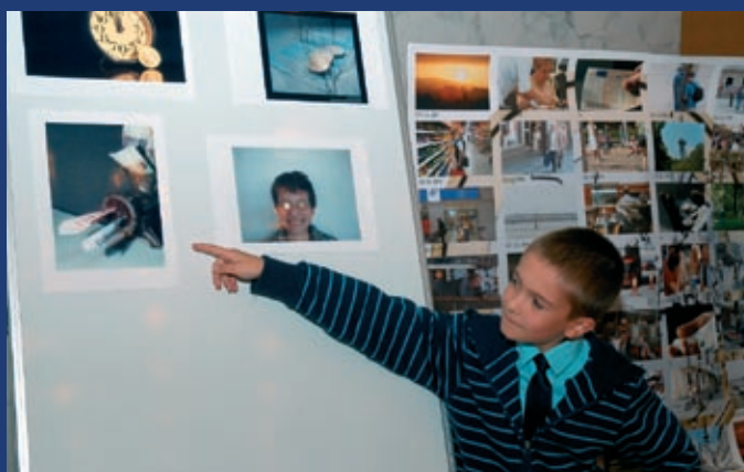
This is how I see the euro!